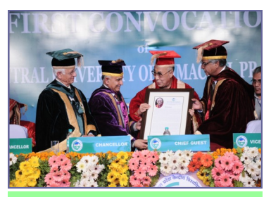
The Dalai Lama being conferred with the Honoris Causa doctorate

was increased as they were trying to cut the thread of other kites soaring high in the sky.