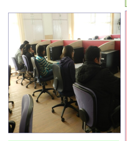
Students surfing the web through LAN connectivity in the campus

The University has 1GBPS dedicated leased line provided by NKN (National Knowledge Network). The network is maintained by NIC (National Informatics' Centre). All the Central Universities of India are interconnected and covered under a project titled "National Mission of Education Information and Communication Technology through LAN connections.